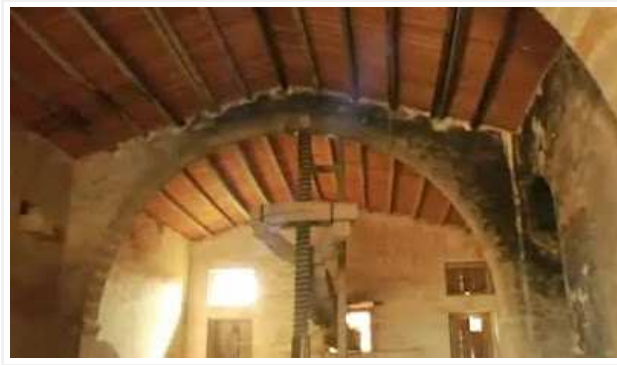
The room where the grapes arrive, known as a Palmento, is where the first work begins after the grapes are harvested.