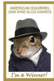
American Squirrel 2009 Wine Blog Awards